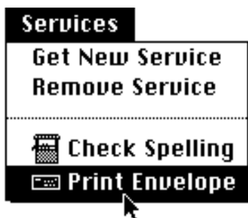
Figure 2: Writeswell Jr.'s Services Menu

Writeswell Jr. is a simple "TeachText-like" word processor with a Services menu: